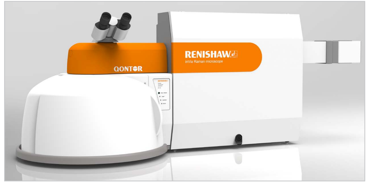
The Renishaw inVia Qontor confocal Raman microscope