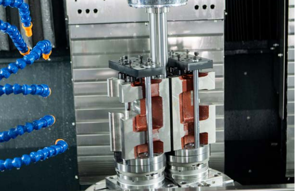
Dawn Machinery vertical cylindrical grinder