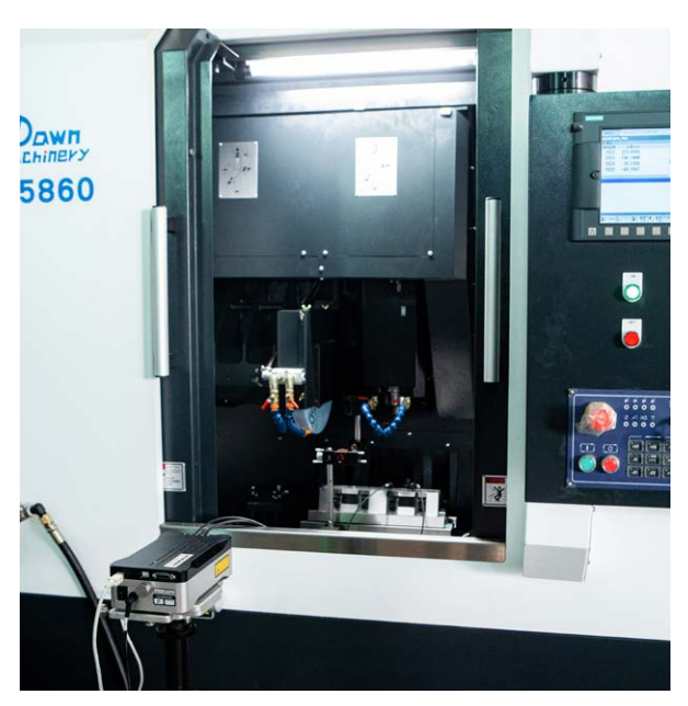
XL-80 laser intermerometer system used to check dynamic accuracy of Dawn Machinery's machine tools

The commercial success of building custom-made machine tools requires careful attention and efficiency. Error inspection and correction during assembly needs to be fast and accurate, while labour costs have to be minimised. Faced with increasing customer demand, Dawn Machinery Co., Ltd (Dawn Machinery) chose to replace its traditional granite square and dial indicator metrology in favour of Renishaw's XK10 alignment laser system.