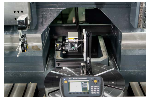
Squareness measurement with XK10 alignment laser system

The XK10 system is very portable and easy to set up. Our operators only need to follow the display unit instructions to complete a measurement process. Overall, I estimate that our machine tool inspection efficiency has been improved by at least 50%.