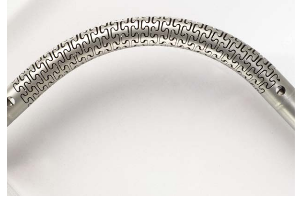
Nemcomed's patented Flex-Shaft is used in surgical screwdrivers, taps and drills.

Knowing the machine's capability before it cuts parts allows us to minimize scrap and machine downtime. That gives us high part-quality and productivity while keeping manufacturing cost down. It's what Lean Manufacturing is all about - greater customer value.