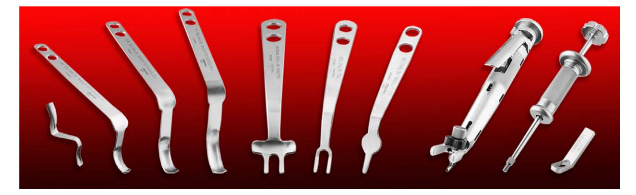
Nemcomed is a division of Avalign Technologies. The company supplies medical implants and speciality instruments for the orthopaedic, spine and trauma sectors.

The new ballbar design brings the unique advantage of testing in three orthogonal planes through a single reference point, with a single setup, which allows the accompanying software to produce a representative measurement of volumetric positioning accuracy by correlating all three.