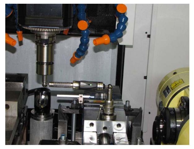
Nemcomed uses small machines to produce medical implants and instruments, and the wireless aspect of the QC20-W makes it easier to manoeuvre in tight interior spaces.

The ballbar comes with a system case with spaces for the most popular accessories making it easy to transport. "We can take it to any of our four global manufacturing facilities, set it up quickly and get the machine qualifications we need," Arnold said. "Knowing the machine's capability before it cuts parts allows us to minimize scrap and machine downtime. That gives us high part-quality and productivity while keeping manufacturing cost down. It's what Lean Manufacturing is all about - greater customer value." The company completed another 14,000-sq-ft. expansion in November, and as it continues to grow, Arnold said use of the ballbar will grow.